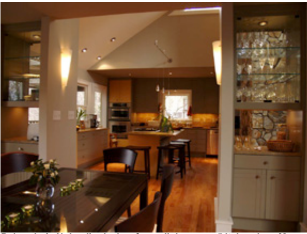
Deborah A. Noland's design for a dining room/kitchen in a Myers Park residence, Charlotte. Photo provide by Deborah Noland.